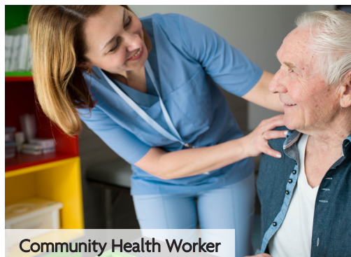
Community Health Worker

Note: youth and pre-apprenticeship programs (to prepare for apprenticeships) are also available. Contact www.dir.ca.gov for more information.