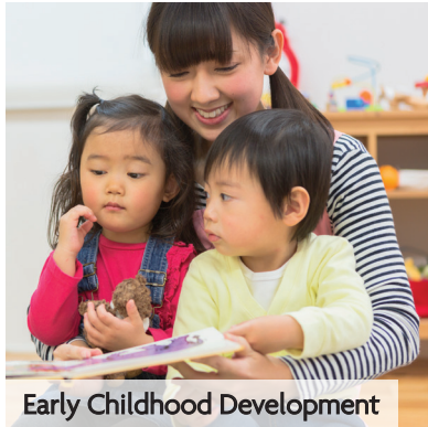
Early Childhood Development