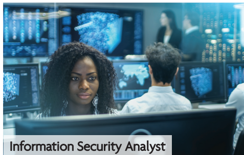
Information Security Analyst