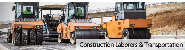
Construction Laborers & Transportation

*Not all apprenticeship programs offer college credit for their related instruction.